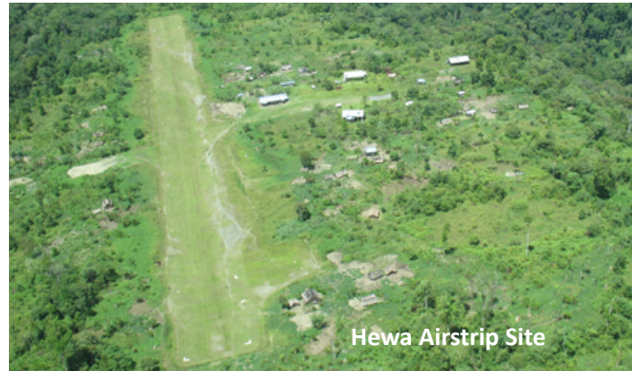
Hewa Airstrip Site