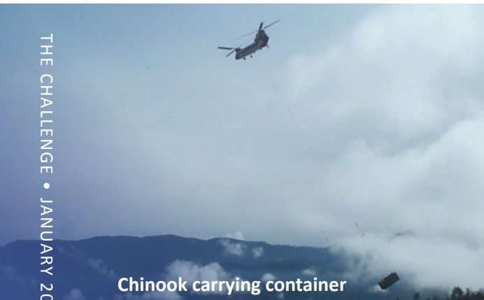
Chinook carrying container

to an elevation of 7,000 feet. The only helicopter in the area was a small one owned by New Tribes Mission for small supply drops and medical trips.