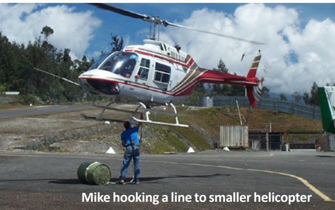
Mike hooking a line to smaller helicopter