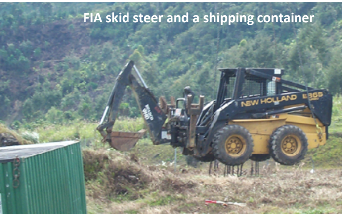
FIA skid steer and a shipping container