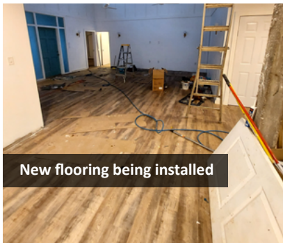
New flooring being installed