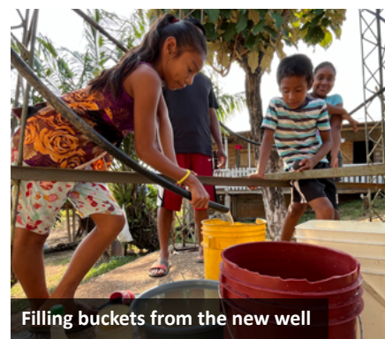
Filling buckets from the new well

“For even the Son of man came not to be ministered unto, but to minister, and to give his life a ransom for many.” — Mark 10:45 (KJV)