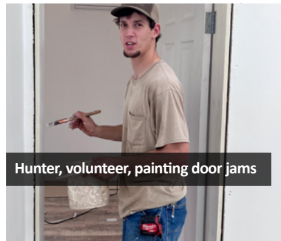
Hunter, volunteer, painting door jambs