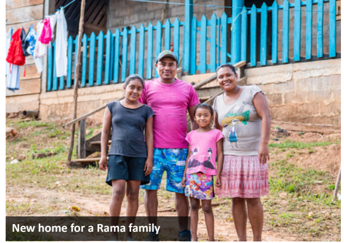
New home for a Rama family

adjust to their way of living. The Rama are a group of indigenous people located on the Caribbean coast of Nicaragua. They have approximately nine different tribes, with their culture dependent on self-sufficiency. Most fish and farm for a living and grow up in the Moravian church. Initially the Rama deeply connected their spiritual beliefs with nature, but today, there are a growing number of born-again believers in Jesus Christ.