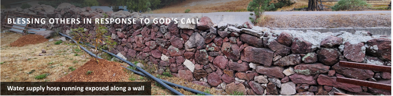
Water supply hose running exposed along a wall