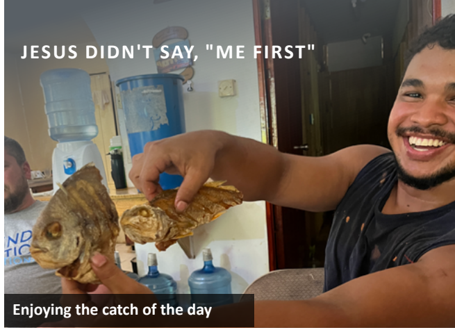
JESUS DIDN'T SAY, "ME FIRST"