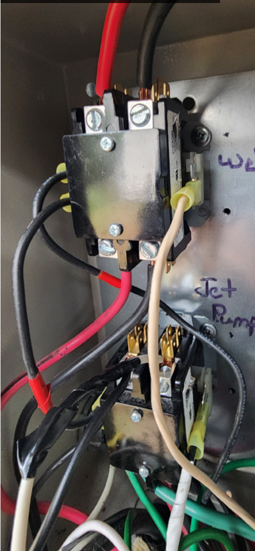
Well pump wires covered only with electrical tape

It is not uncommon to find live wires protected more by electrical tape than sheathing!