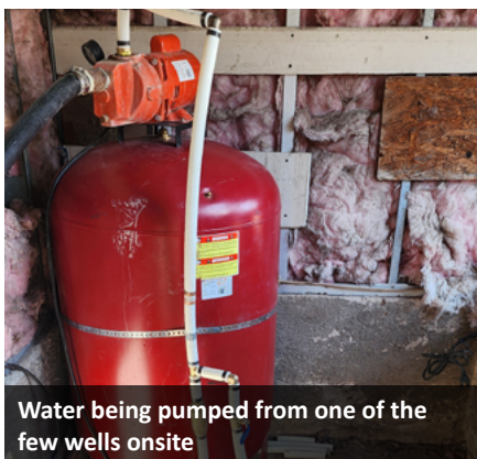
Water being pumped from one of the few wells onsite